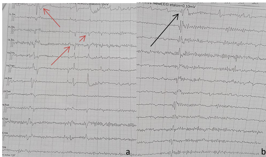
Fig. 3. The electroencephalogram shows: a. isolated spikes in both hemispheres with closed eyes (red arrows); b. in hyperventilation, multiple synchronous sharp waves in both hemispheres (black arrow).