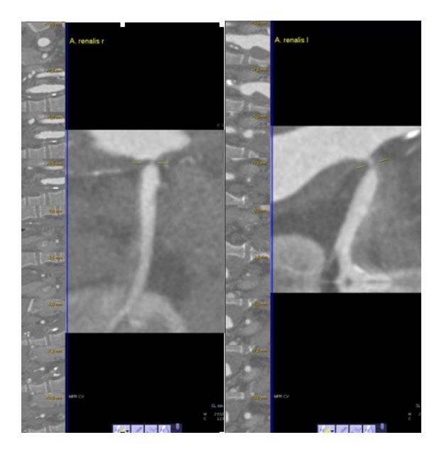
Fig. 5. Curved planar reformation (CPR) images of CT angiography - stenotic renal arteries

On the left side, the left internal iliac artery (LIIA) was supplied by the left lumbar collateral artery. Only the left common iliac artery bifurcation was opacified. The left external iliac artery (LEIA) was supplied by collateral circulation. Left deep inferior epigastric and left deep iliac circumflex arteries supplied the left common femoral artery. Left superficial femoral, deep femoral and popliteal arteries were permeable, without stenosis. The arteries of the left leg were normal. There was an important pelvic and abdominal parietal collateral circulation.