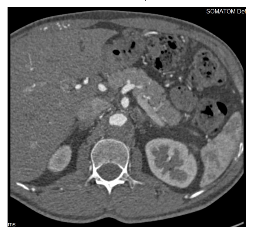
Fig. 3. The last axial cross-section image of coronary CT angiography: important parietal thrombosis of abdominal aorta; important arterial network into right abdominal rectus sheath, neither into the left one

3 cm diameter but its permeable lumen was 1.7/1.3cm. An important arterial collateral network of right internal thoracic artery was developed into the right rectus sheath (Figure 3).