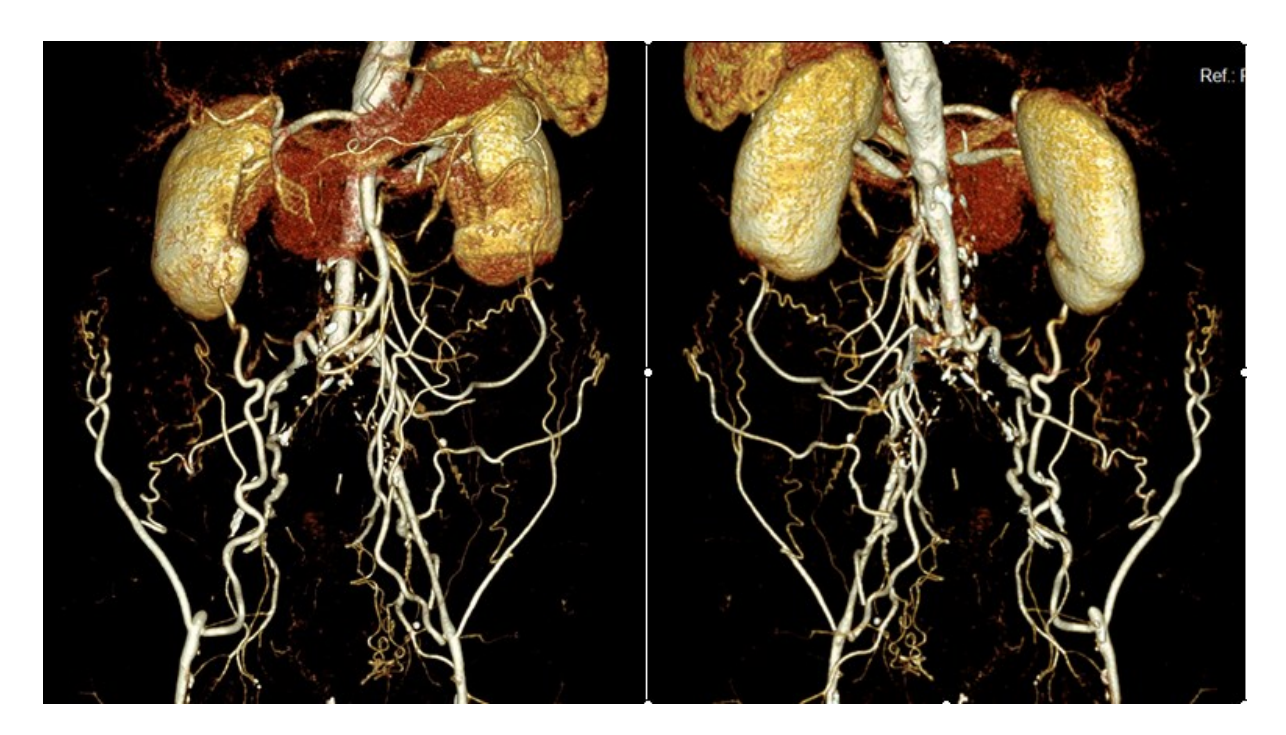
Fig. 4. Three dimensional reconstruction with volume rendering techniques (VRT) shows the occluded aorta, the occluded common iliac arteries and the arterial anastomoses that supply the inferior limbs (anterior and posterior views)

inferior limbs using CT angiography. The angiography showed that the patient abdominal aorta was occluded inferior to the renal arteries. At the emerging of celiac trunk, abdominal aorta presented circumferential parietal thrombosis, about 7.4 mm thickness. At the SMA emerging the parietal thrombosis was 1.05cm thickness. There was no stenosis of celiac trunk or SMA emerging (Figure 4). The parietal thrombosis circumscribes the two ostia of renal arteries causing critic stenoses of 75-80% on the left side and 85-90% on the right side (Figure 5).