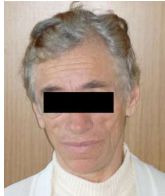
Fig. 3. Patient at age of 65: significant loss of subcutaneous fat including the Bichat's fat pad

Thorax examination showed bilateral basal dry crackles and dullness to the left base. Systemic blood pressure was around 140/70 mmHg and heart rate 60 beats/min. A strong systolic heart murmur was audible in all areas of auscultation with a maximum of 6/6 intensity in the mitral and aortic areas.